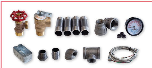
Included Parts Kit