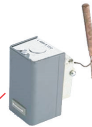
Honeywell Aquastat L4080B1352 (Field installed)