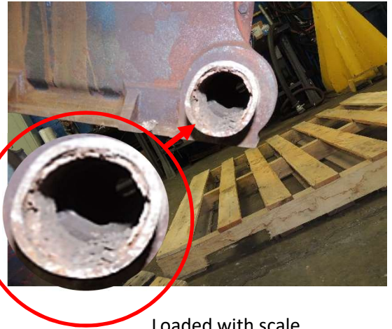
Loaded with scale