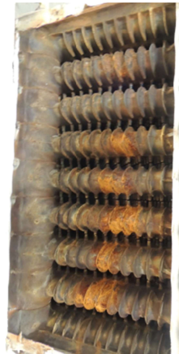
Multiple sections fractured

Failures caused by scale build up are due to neglect and not considered to be manufacturing defects. They are not covered by the warranty.