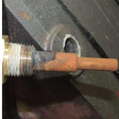
LWCO Probe fouled