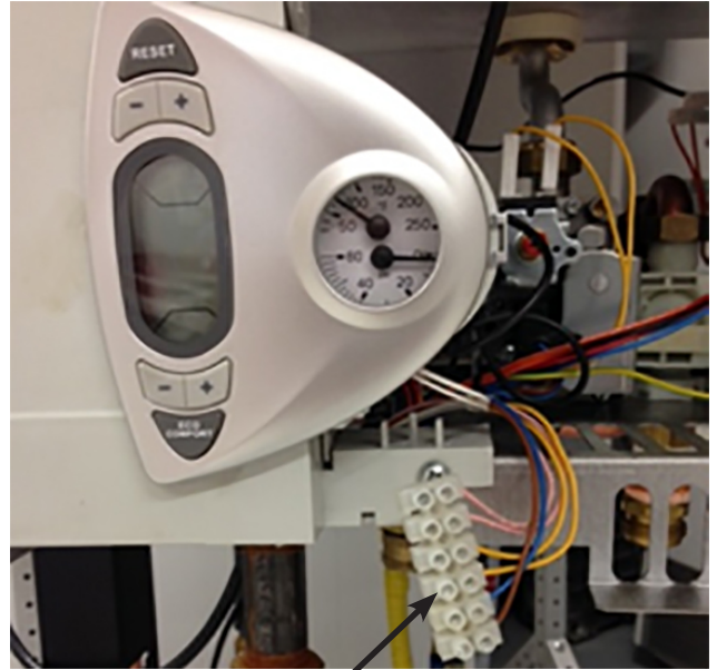
Low Voltage Terminal Strip Removed