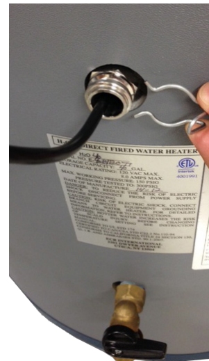
Figure 3 - Sensor Wire Secured to Well With Clip