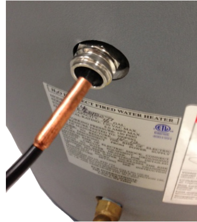
Figure 2 - Secure Sensor Wire to Well With Clip