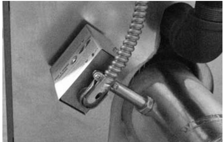
Figure 4 - Acceptable Mounting Position 2